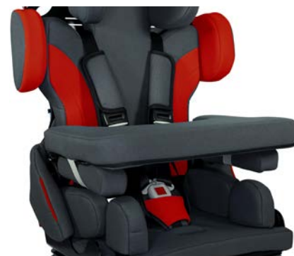
491 Anterior support, table