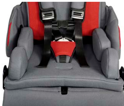
433 Front cover