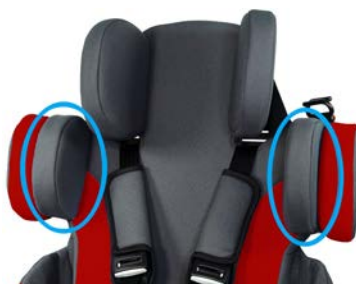
483 Shoulder pads