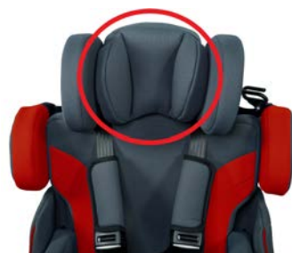
494 Head pad, width reducer