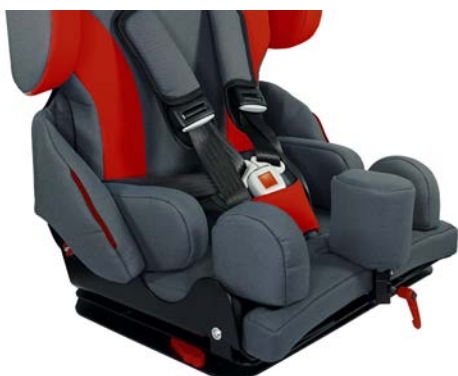
488 Abduction block