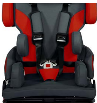
486 Lateral trunk supports, rigid