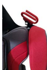
492 Add. upper belt guide*