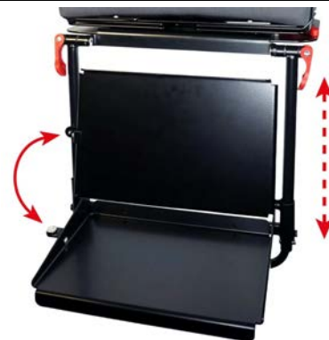
481 Footrest, foldable, angle adjustable