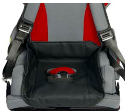
497 Incontinence seat pad