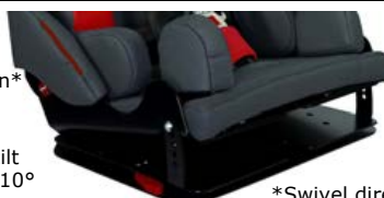
*Swivel direction CANNOT be changed!