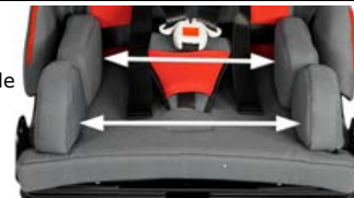
Hip & leg guide adjustment

This is a Universal Restraint System for disabled children. It is approved in accordance with Federal Motor Vehicle Safety Standard 213 for general use in vehicles and it will fit most but not all cars. A correct fit is likely if the vehicle manufacturer has declared in the vehicle handbook that the vehicle is capable of accepting a Universal Restraint System. Only suitable for use in vehicles with 3-point (lap & shoulder) seat belts.