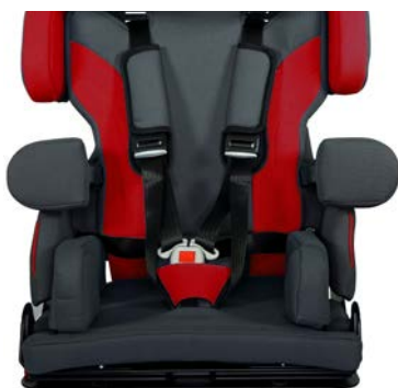
487 Lateral trunk supports, swing-away